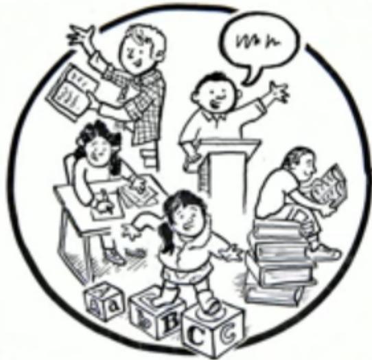
ENGLISH LANGUAGE ARTS