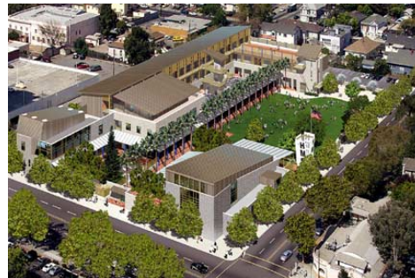
Horace Mann Elementary School

In keeping with our school-wide focus on school wide continuous, reflective, improvement, Horace Mann staff, and students constantly examine their