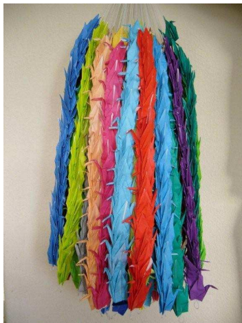
1,000 Cranes to Grant a Wish for Japanese Victims Affected by the Earthquake-Strung by Sayuri Kabutogi